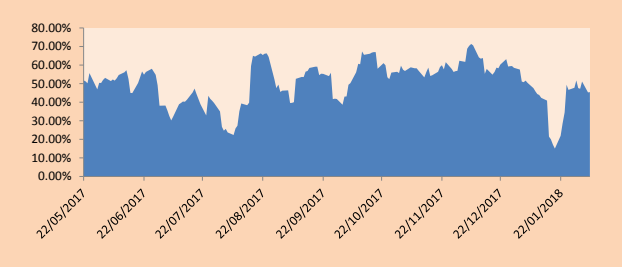
Correlation Graph of Returns of Mining Index against Metallic Index of London (3 months

*Legend: Variation 1D: 1 Day; 5D: 5 Days, 1M: 1 Month; YTD: Var.% 12/31/17 to date